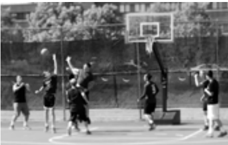
Players watch as a long shot was taken.